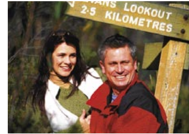
Opposite: The sandstone cliffs of Hanging Rock in the Grose Valley. This page: One of Blackheath's walking tracks; Katoomba's Three Sisters; a glorious backdrop; meet a colourful local.