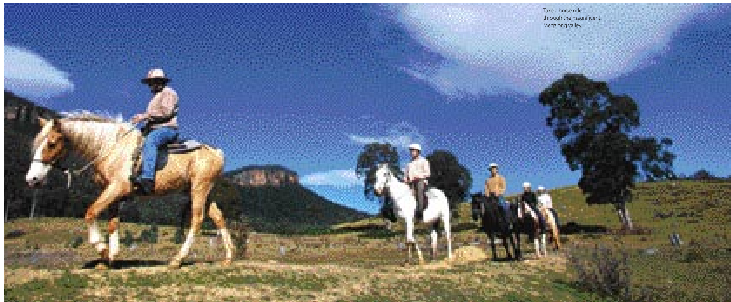
Take a horse ride through the magnificent Megalong Valley.